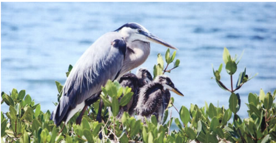
Photo of Great Blue Herons